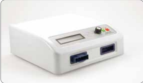
CircuFlow™ 5200 Pump